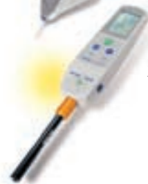
X-mate Pro portable pH/multiparameter instrument