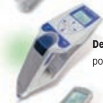
Densito 30PX portable density meter