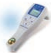
Refracto 30GS portable high-end refractometer

Oxygen, Brix, pH-value, refractive index, alcohol concentration, salinity, Oechsle, etc. – Thanks to exchangeable modules (Xmate Pro ) and flexible calculations and conversion tables (Densito/Refracto), the PortableLab™ instruments cover a huge application spectrum.