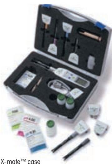
X-mate Pro case