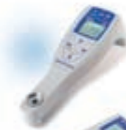
Refracto 30PX portable refractometer