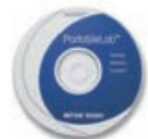
The HelloCD™ «getting-started» tutorial